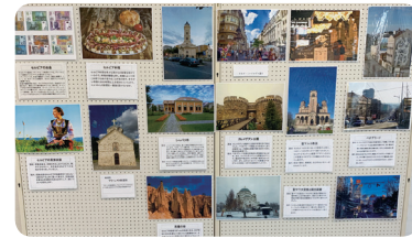
The display also introduces prominent Serbian natives such as Nicola Tesla, an inventor of the fluorescent bulb.

Getting there: From Shiki Station on Tōbu Tōjō line, take the Tōbu bus bound for Lalaport Fujimi, exit at Terashita-Danchi (about 12 min.), walk 2 min.