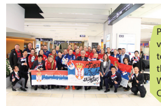
Presenting video message to athletes at the 2019 World Women's Handball Championship.

After becoming a host, we began more active engagement with our Serbian friends—producing support videos for Serbian athletic teams, holding a Serbian food sampling event, and planning for further activities.