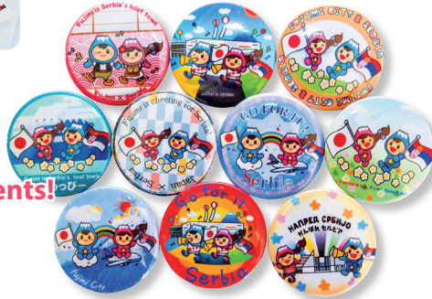
Colorful badges with various designs—plums, Mt. Fuji, and more. (Production is limited to 10,000 badges.)

As Serbia is the world’s third largest raspberry producer, the Festa offered raspberry sponge cakes (Serbian berries) filled with blueberry-flavored white bean jam.