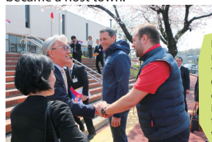
Inspection by representatives of the Serbian Olympic Committee, in connection with our invitation to host the handball and wrestling teams.

In March 2018, after receiving our city's offer to provide pre-game accommodations, Serbia's Olympic Committee came to investigate. In November we met with Committee chairman Božidar Maljković, and in December we officially became a host town.