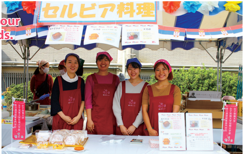
Participants at the Serbia Festa, in November 2019, experienced Serbian folk dancing and enjoyed Serbian cuisine prepared by students from Saitama's Kagawa University of Nutrition.

The Republic of Serbia lies inland within the Balkan peninsula, where southern Europe reaches out to to Asia. Fujimi and the Serbian city of Šabac have enjoyed a deepening relationship ever since becoming sister cities in 1982. As the Olympics approach, Fujimi is ready with pre-game accommodations for handball and wrestling teams, as we also look forward to engaging with Paralympic athletes, and to hosting numerous special events within our city. Our host activities will build even stronger bonds between our cities.