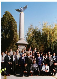
Second trip to Šabac, in 1983, with our mayor in attendance. The visit included a performance by the Fujimi Drum Group in the city's assembly hall.

Like Fujimi, Šabac is an agricultural city located close to its country's capital. Fujimi representatives have visited Šabac seven times to date, and we have each donated to the other in times of crisis.